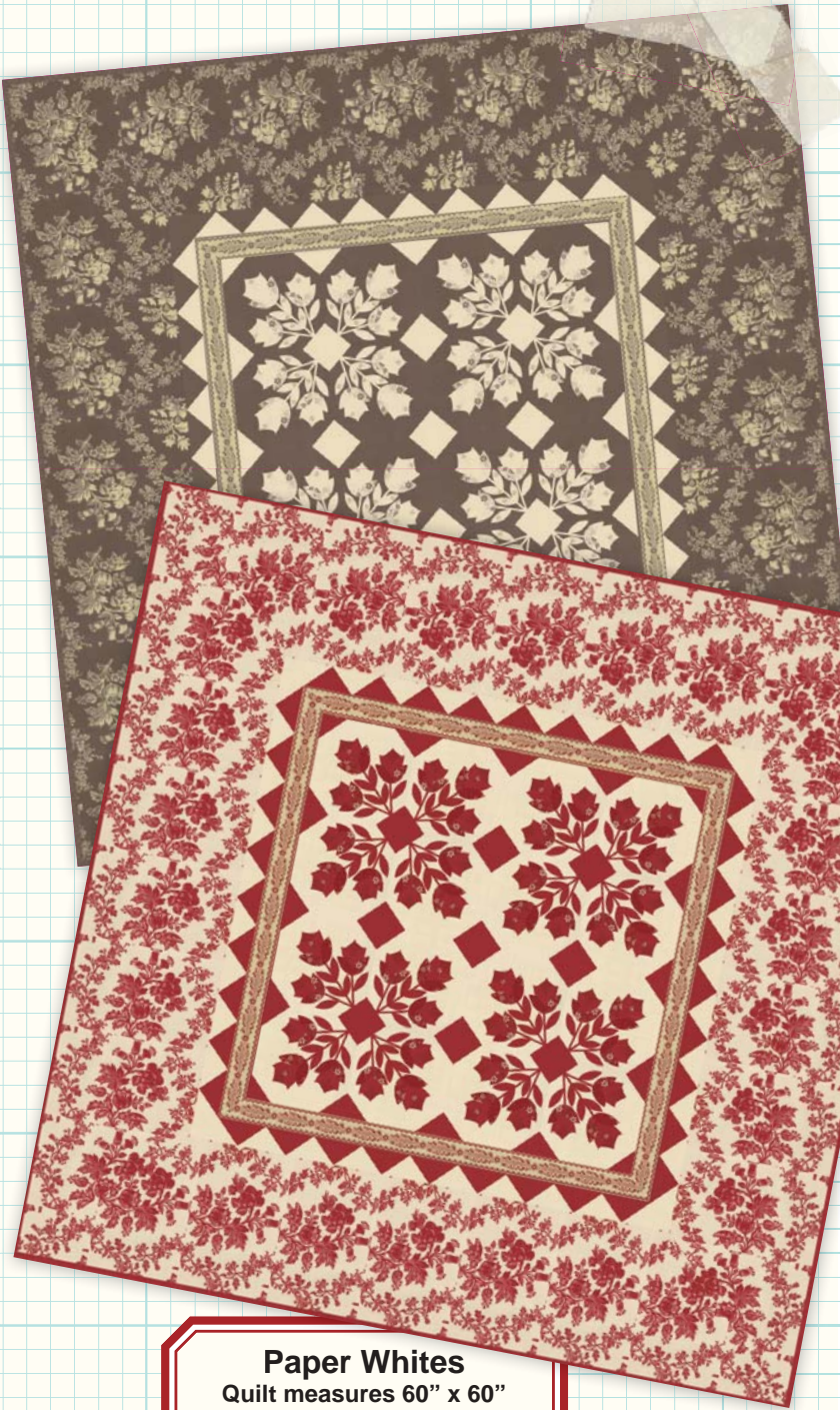
Paper Whites Quilt measures 60" x 60" #PSD 388P/#PSD 388PG Pattern includes 2 colorways