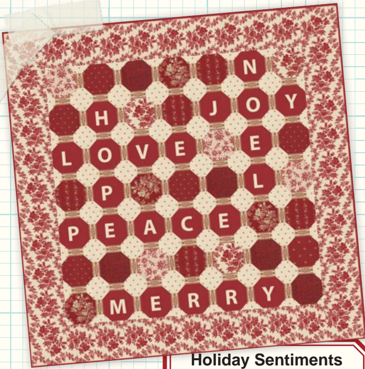
Holiday Sentiments Quilt measures 88" x 88" #PSD 389P/#PSD 389PG