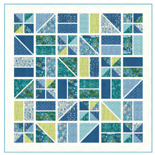
Cream Version Lap 64 1/2" x 64 1/2"