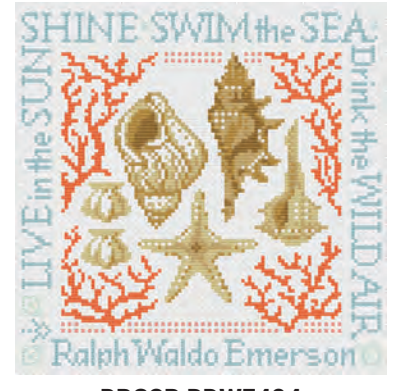
RPCSP BDWE424 Beach Day with Emerson 8" x 8"