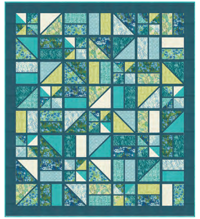
Lagoon Version Twin 74 1/2" x 83 1/2"