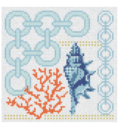
RPCSP MBH1421 Modern Beach House 1 5" x 5"