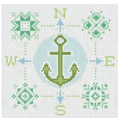
RPCSP AL423 Anchored Life 6" x 6"