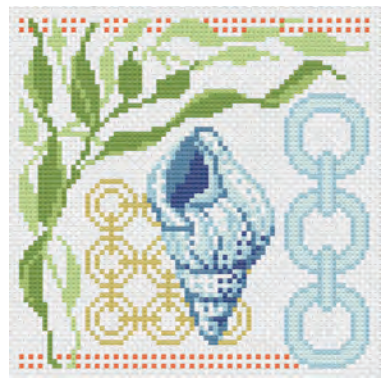
RPCSP MBH2422 Modern Beach House 2 5" x 5"