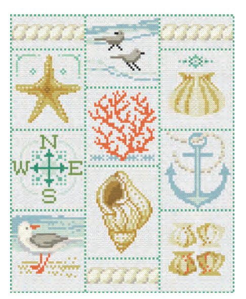
RPCSP SS425 Shoreline Sampler 8" x 10"