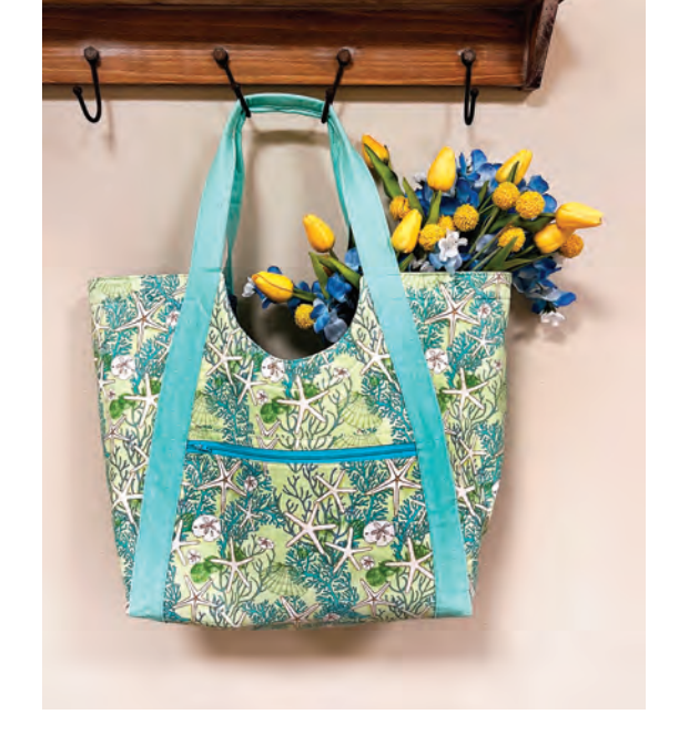
AG 533 Poolsize Tote by Noodlehead