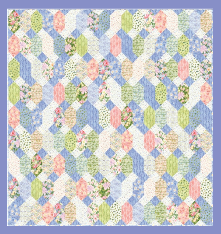
JC 266 Cora 81" x 86" by Janet Clare Additional size available as 63" x 57"