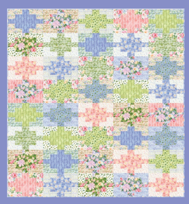
JC 265 Mabel 75" x 80" by Janet Clare Additional size available as 60" x 50"