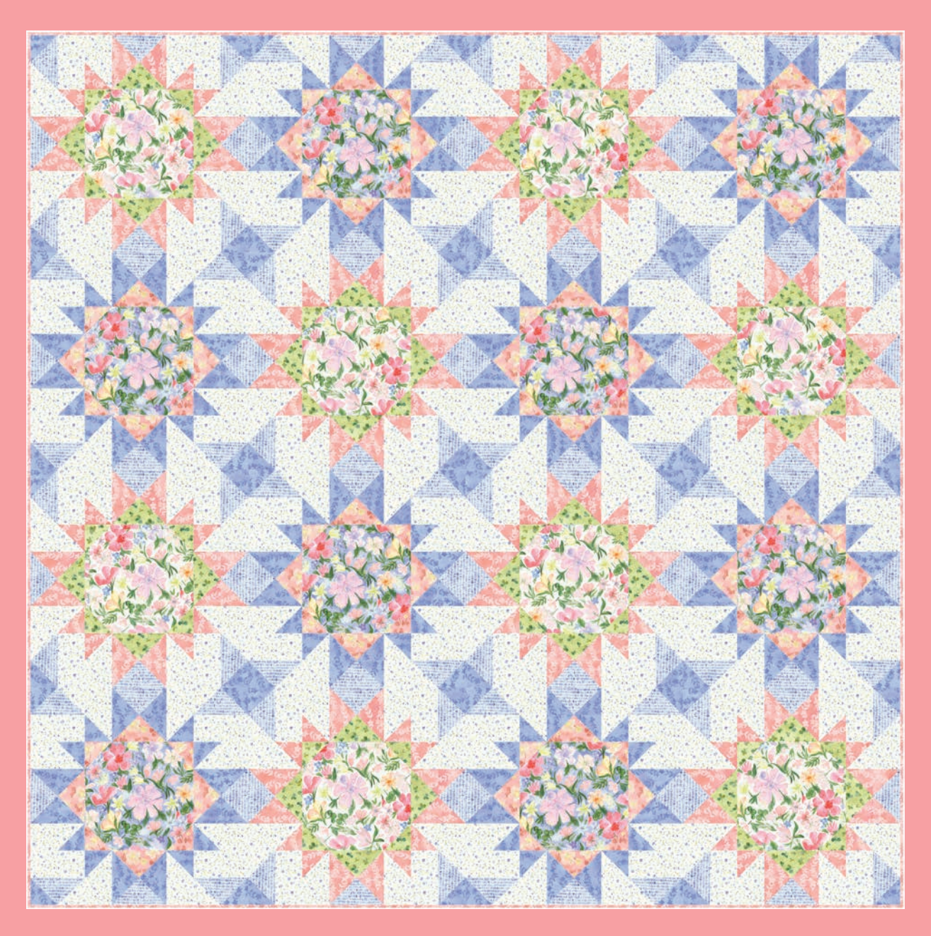
JC 267 Edith 80" x 80" by Janet Clare Additional size available as 60" x 60"